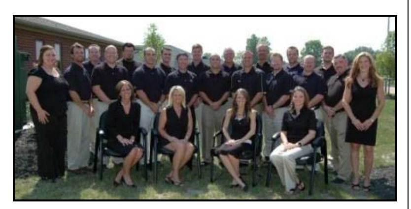
"ACG trained our entire staff on the benefits of offering a finance solution to our customers. Now with the help of ACG, we control the entire sales cycle!"